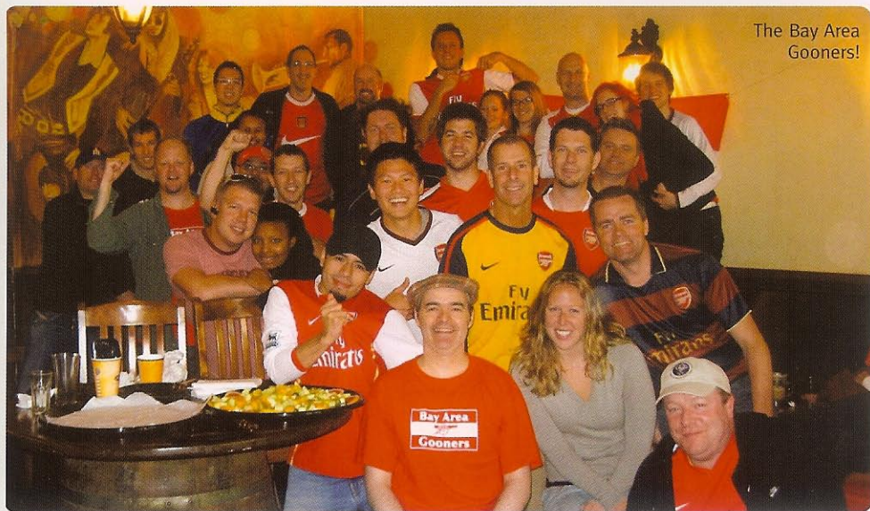
The Bay Area Gooners!