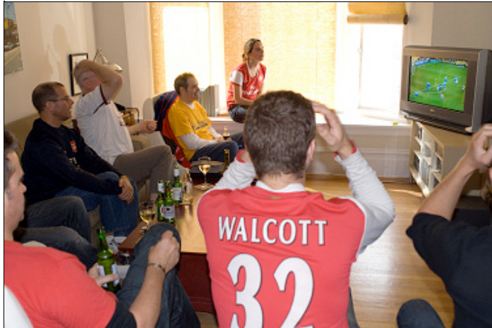
Reading v Arsenal as experienced a few thousand miles west of the Madejski

Being an American Gooner presents its own unique challenges. The quizzical looks from people when you tell them you support an English football team, "Uh, you mean, like rugby?" or the derision from American football fans. The advent of the internet and satellite television has of course been a boon, allowing us to see most if not all the matches, keep up-to-date on all the team news, and read the latest Online Gooner (though I still maintain my overseas subscription). Still, telling co-workers you were sitting in a pub at 6am on a weekend morning to watch a sport most of them don't know the first thing about tends to raise more than a few eyebrows.